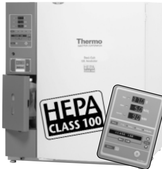
figure 1–Steri-Cult CO 2 Incubator with Class 100 Air

Class 100 air is achieved and maintained within the Series II Water Jacketed, Steri-Cycle, Steri-Cult, and Steri-Cult R CO 2 Incubators by way of our advanced incubator design and HEPA Filter Airflow System.*